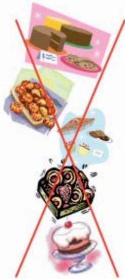
Brought to you by Mac Chap Women's Group

Funds raised through the Cakeless Cake Day will be used to support this ministry through buying food and clothing and providing safe transport for volunteers making distributions.